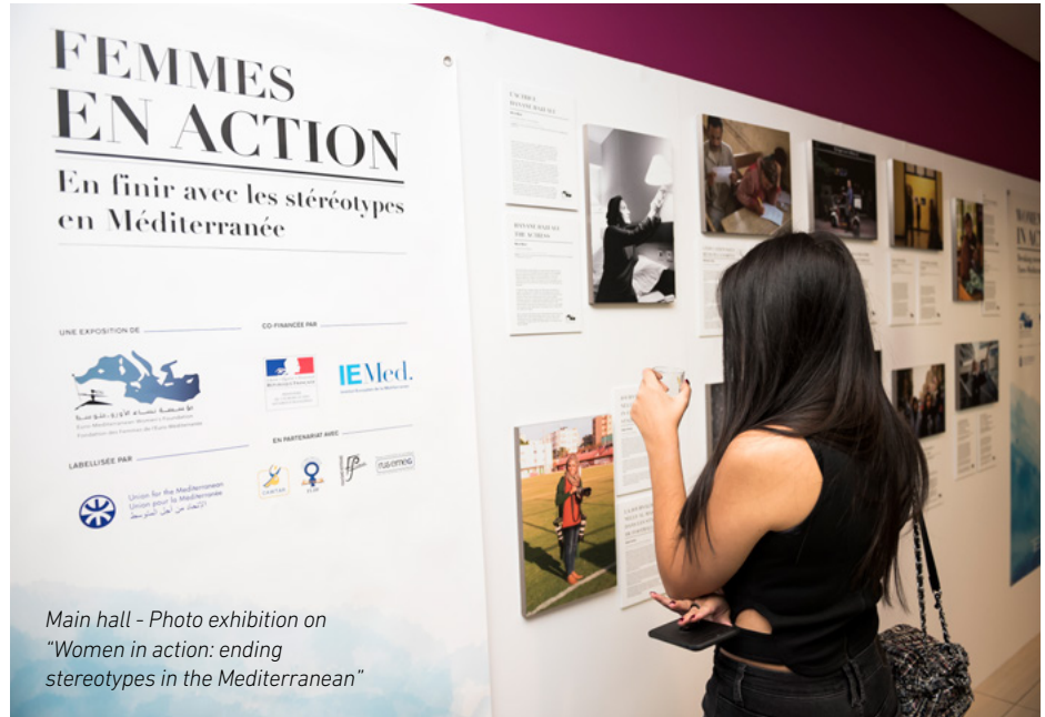
Main hall - Photo exhibition on "Women in action: ending stereotypes in the Mediterranean"

The Conference focuses on women's leadership as catalysts for change and as drivers of solutions to address regional challenges. It raises awareness about the untapped capacity and talents of women in the region and the need to overcome cultural and social barriers to drive actions for gender equality.