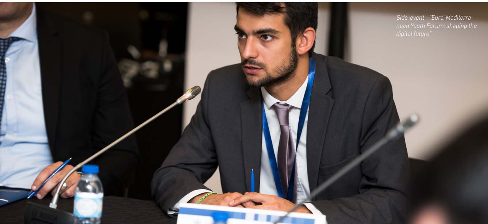
Side-event - "Euro-Mediterranean Youth Forum: shaping the digital future"