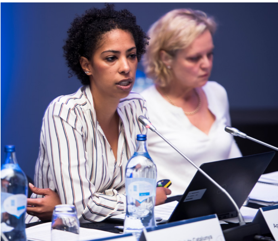
Side-event - "UfM Regional Dialogue on Women Empowerment"

vernments, parliaments, private sector, international organisations, civil society, academia, media, young women and men— to work together as a collective intelligence platform that discusses, generates ideas and solutions, exchanges experiences and identifies concrete actions toward advancing gender equality in UfM countries.